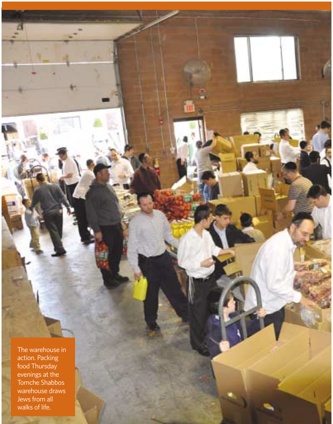
The warehouse in action. Packing food Thursday evenings at the Tomche Shabbos warehouse draws Jews from all walks of life.

“Someone actually visited this woman’s house and saw that she had