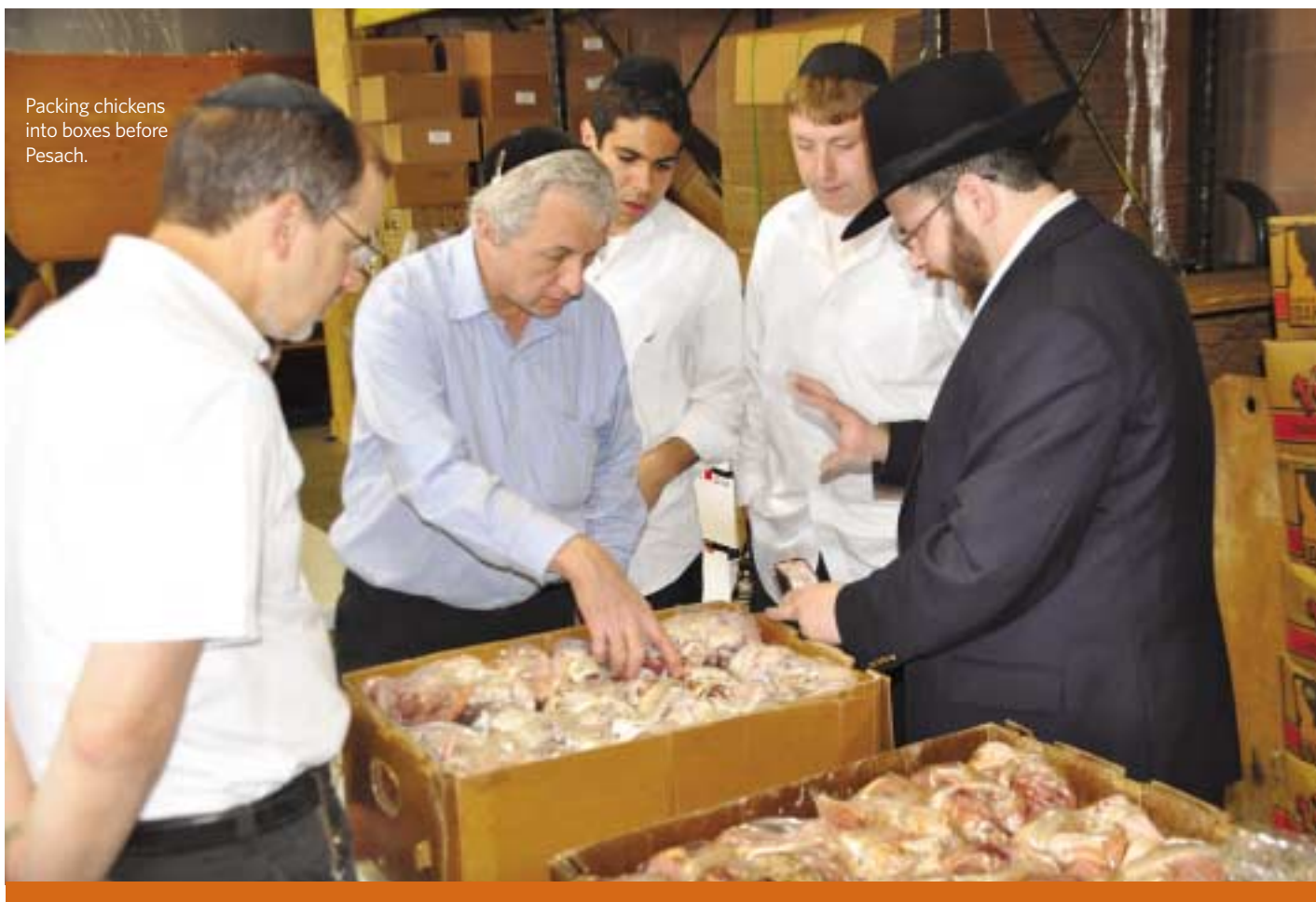
Packing chickens into boxes before Pesach.

qualified tax attorneys and accountants who volunteer their time. One of the newest innovations is a program called Partners in Parnassah, which helps out-of-work people find jobs.